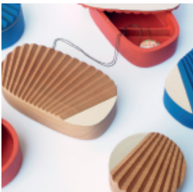
MINIPORTRAIT cherry wood boxes designed by Ilaria Innocenti & Giorgio Laboratore

Colours: Natural, dirty pink, dark gray, blue, coral.