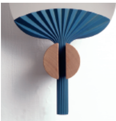
SELFPORTRAIT wood and steel hand mirror designed by Ilaria Innocenti & Giorgio Laboratore

Colour versions: colorful (pic) o soft tone